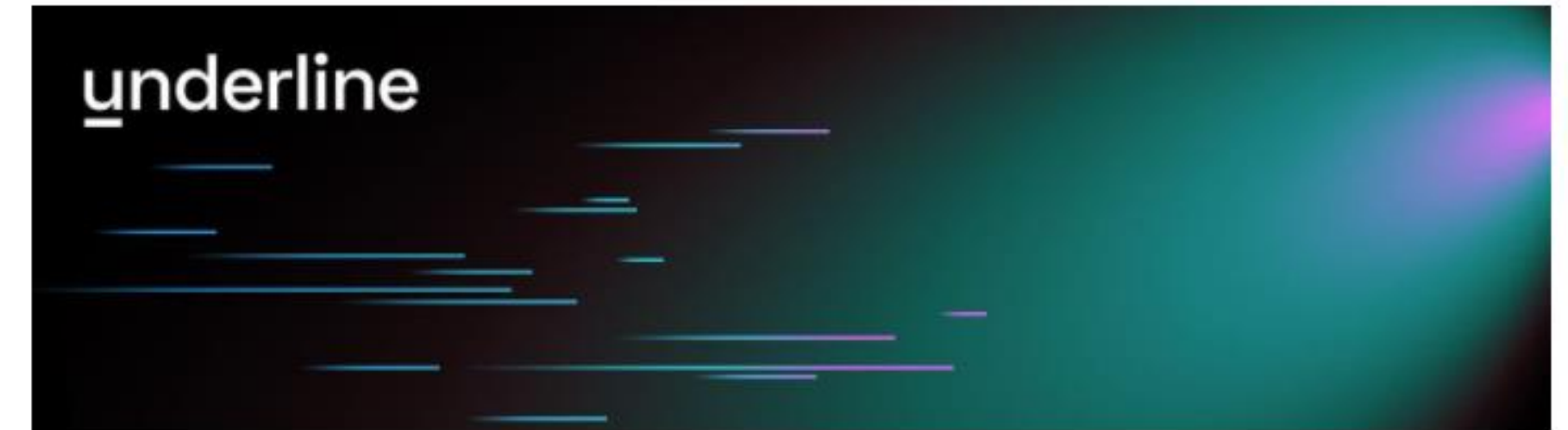
MMM 2020 Speaker Form

If you did not use the Screen-O-Matic software to record your video but instead used your own preferred platform, you will also need to upload your recording file on this form